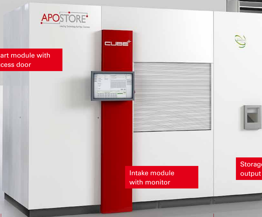
Intake module with monitor